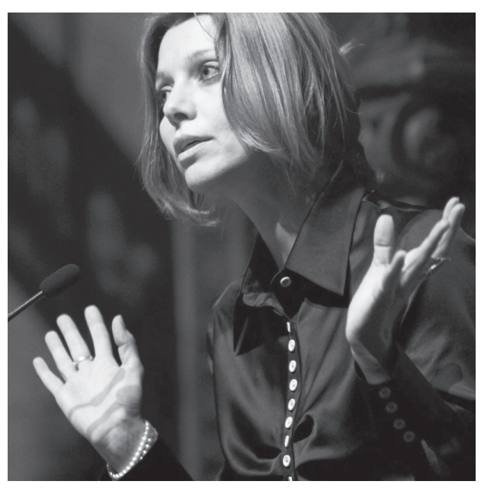
Elif Shafak at 2008 Winternachten Festival

• Pacing — Sometimes you will pause to let a point sink in. At other times you will build to a crescendo. Mixing up the tempo is part of keeping the group engaged.